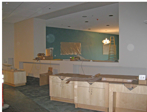
Photo of the Mastodon case under construction.