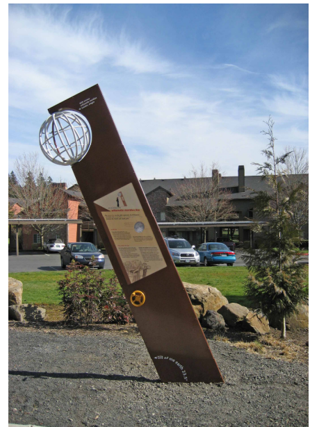
Tualatin's new Meridian Marker

Park at Browns Ferry Park and use the pathway to reach the marker. Signs and volunteers will guide the way.