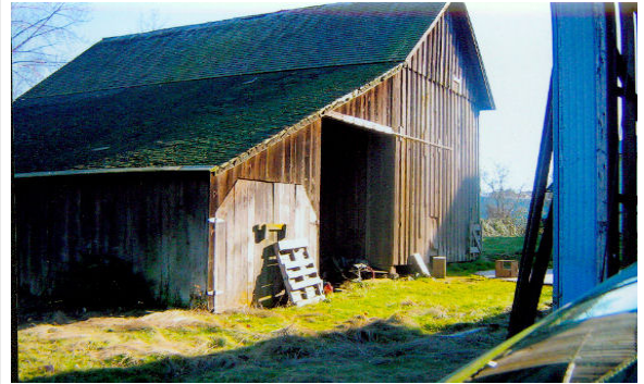
All Koch Farm barns and houses on Tualatin-Sherwood Road, were demolished the week of April 12, 2009.