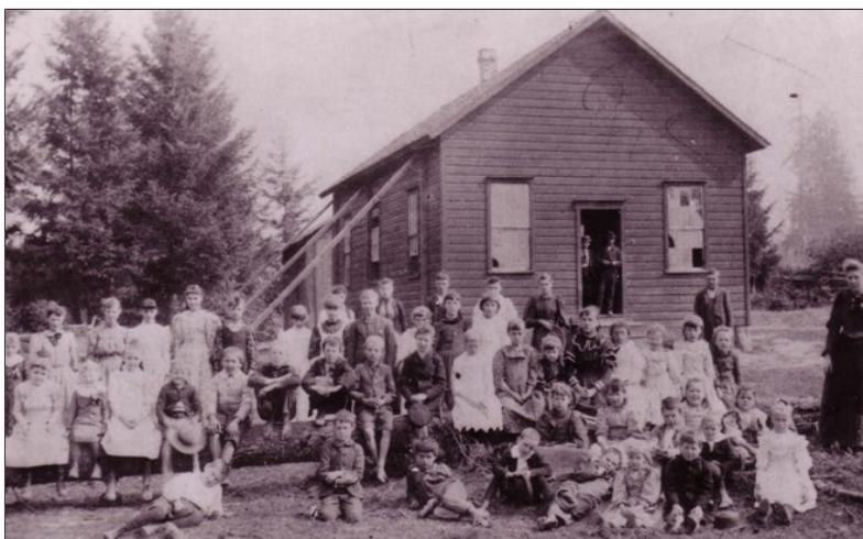
Tualatin's Little Red Schoolhouse in 1899. The new coloring book pictures what daily life was like for these children over a century ago.

The book will be given to Tualatin 4th-graders at the Pioneer Days events at the Heritage Center May 19-22, and will be available for sale at the Center for $4. A grant for the project was provided by the Cultural Coalition of Washington County using funds from the Oregon Cultural Trust. Donations to the Trust are a credit for Oregon income tax when donors also give to an organization like THS.