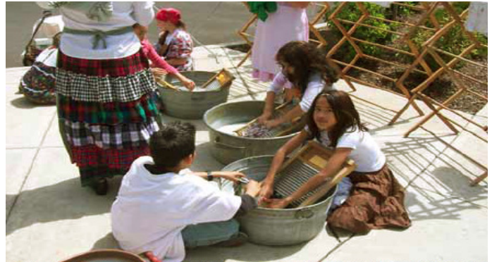
Students from Tualatin Elementary learn how to wash clothes the old fashioned 'Fels Naptha' way.