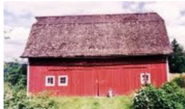
Barn # 1