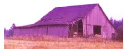
Barn # 3