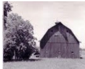
Barn # 2