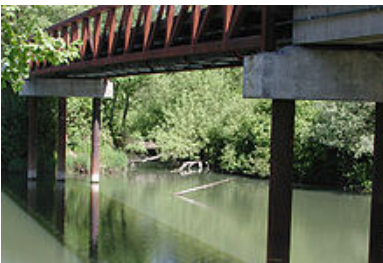
Above: Fanno Creek joins the Tualatin River near the Ki-a-kuts Bridge.