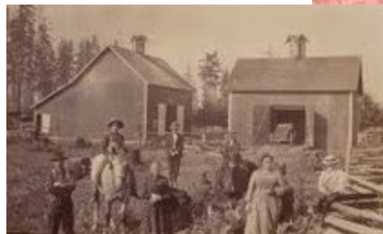
Barn # 4

These pictures of old barns, presumably in Tualatin once, and maybe still, are a mystery. They've been added to the Society's photo collection over the years with no identification. If readers know where any of them are and on whose farm they once stood, please let us know.